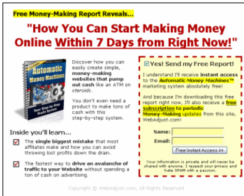
Image: Example Squeeze Page